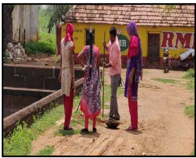
Cleaning the Temple (Inside)