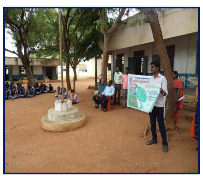
For girls school students, sexual abuse and good touch, bad touch counseling was given by computer science students.